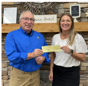
Escanaba Knights of Columbus

Thank you to the following for your financial gifts: Christ the King Lutheran Church, Garden Christian Fellowship, Heart of the North Leo Club, Knights of Columbus of Gladstone, Lakeside Christian Church, Lighthouse Church of the Nazarene, Sackerson Charitable Foundation, Salem Lutheran Church, Sisters of St. Paul de Chartres and the Wells Lioness Club.