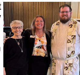
Immanuel Lutheran Church

Thank you to Delta Church and Immanuel Lutheran Church for hosting Change for Life.