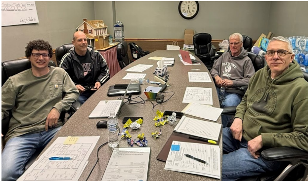
The Building Renovation Committee

When Pregnancy Services purchased the current building in December 2022, plans were in place to eventually make building improvements in order to have the space more usable for the needs of a pregnancy center. In mid-May, those plans began to be fulfilled when a crew made up of mostly Knights of Columbus members began work on the building renovations. The former teller station was demolished, some walls were removed, and other walls were added. Additionally, the former drive-through was closed in at the ends, doors were added and shelving has been built. It is anticipated that the work will conclude by early November. We are so grateful for all the hard work that the renovation crew has been doing!