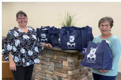
Newborns in Need